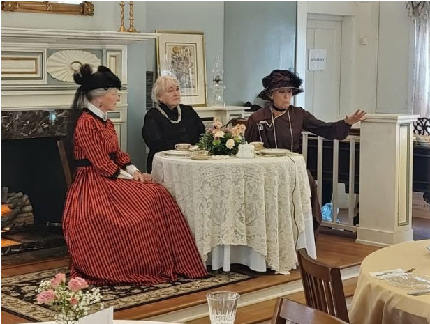
Three First Ladies Spring Tea