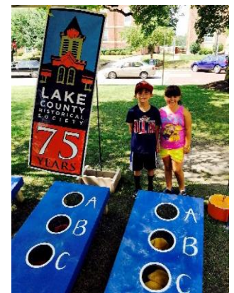
Art in the Park 2015